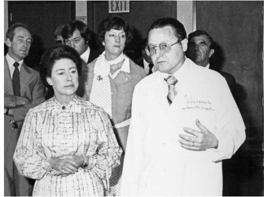
40 years ago... Princess Margaret toured MD Anderson as part of her 1979 tour of the United States

siblings, was held in Friendswood Texas.